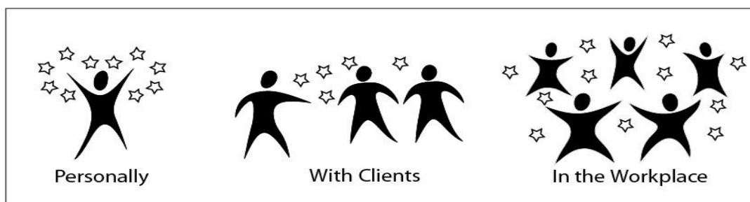
Figure 2. The use of Functional Fluency concepts

Professionally, Functional Fluency concepts are put to use in three ways. Firstly, they are used personally for internal support and inspiration. Next, they are used interpersonally, in the relationship with clients, to support and inspire them. Finally, the clients, in their turn, use the Functional Fluency ideas to support and inspire colleagues and staff in the workplace. The benefits are shared and passed on in a natural progression.